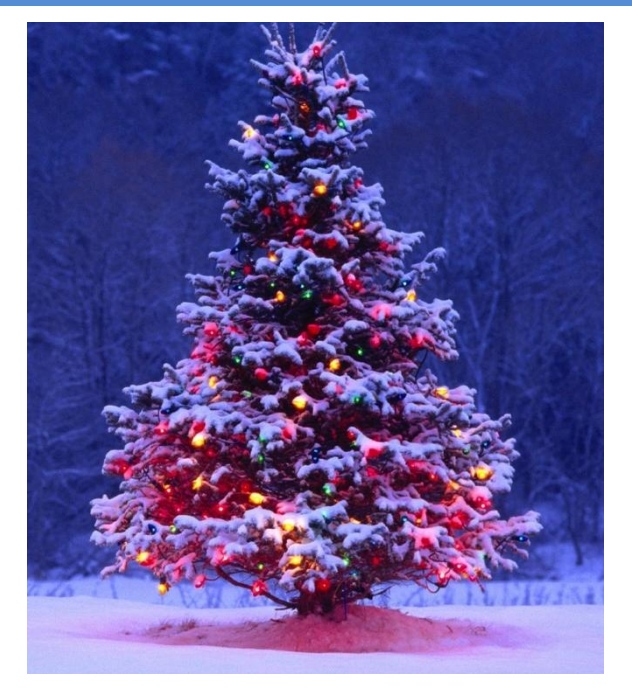
Merry Christmas and a happy New Year!!!